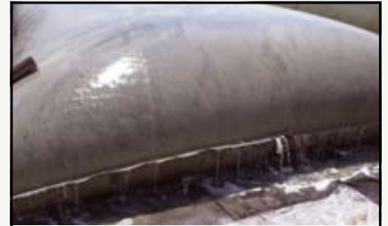
TenCate Geotube® dewatering technology used inline keeps your operation running.

In many cases it is possible to set up a TenCate Geotube® dewatering system inline, so you prevent solids from entering a lagoon. You store water for irrigation, not waste you have to deal with later. The system doesn't interrupt other operations.