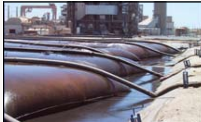
TenCate Geotube® containers at fossil fuel power plant being used to dewater fly ash.

TenCate Geotube® dewatering technology safely contains fly ash, preventing airborne particle contamination from windblown ash piles. The ash can then be used for road base applications or even to build up the berms around a lagoon to increase its capacity. In many fly ash operations, there is no need to add polymer to the dewatering process, making it simple and even more cost-effective.