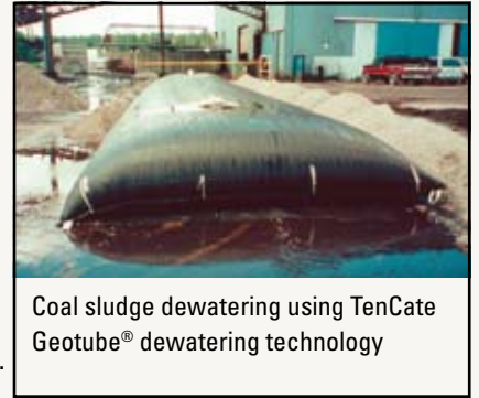
Coal sludge dewatering using TenCate Geotube® dewatering technology

Effluent can be pumped directly from the process; or if a clarifier/thickener is used, effluent from the underflow can be diverted through the TenCate Geotube® container, eliminating the requirement for an expensive mechanical dewatering device. TenCate Geotube® units can be used to capture fines, silts, and clays from the tailings effluent prior to discharge into the ponds or directly into streams. TenCate Geotube® units will separate and dewater the fines and allow disposal without expensive dredging and transporting operations. In some cases, conditioners or polymers are used to promote flocculation to improve solids retention and filtrate quality.