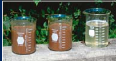
Sludge before and after treatment with TenCate Geotube® dewatering technology.

Thereby it is one of the most effective solutions available. Volume reduction can be as much as 90%, with high solid levels that make removal and disposal easy.