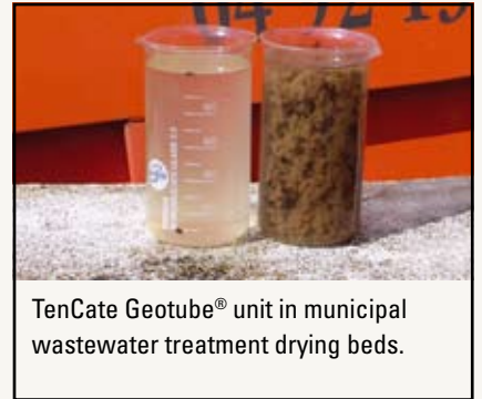
TenCate Geotube® unit in municipal wastewater treatment drying beds.

After the sludge has been treated with a flocculant it is pumped into the TenCate Geotube® where the sediments remain and the water seeps through the pores of the tube. This process can be repeated over and over again until the TenCate Geotube® reaches its maximum level.