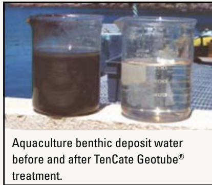
Aquaculture benthic deposit water before and after TenCate Geotube® treatment.

TenCate Geotube® dewatering technology reduces nutrient loading in filtrate. It can be used continuously or intermittently year-round in most climates. It is ideal for lagoon, retention pond, and filter waste applications. It can be used for cage waste removal, benthic table waste cleanup, recirculation waste removal for hatcheries, and processing plant waste dewatering. Dewatered solids can be land applied or disposed of in a landfill.