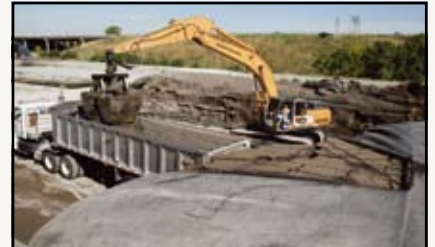
Dewatered sludge being removed from TenCate Geotube® container with an excavator.

This can be accomplished at or very near the site by utilizing a dewatering basin where TenCate Geotube® containers can be stacked several layers high to minimize the space needed. TenCate Geotube® units can be sized for large-scale or smaller applications, and effectively contain even hazardous materials, reducing their volume dramatically and saving thousands in disposal costs.