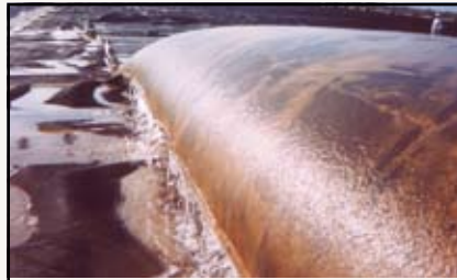
Water draining from a TenCate Geotube® container.

In some cases, companies have dewatered the material in their lagoons using TenCate Geotube® dewatering technology, then used the solid-filled TenCate Geotube® containers as berms. Since they can be stacked on top of each other, you can use them to further add capacity to the lagoons. With TenCate Geotube® containers you can improve the dewatering efficiency. Dewatered solids are protected from becoming saturated again in wet weather.