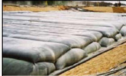
TenCate Geotube® containers in activated sludge basin at paper plant

The rapidity with which a TenCate Geotube® dewatering operation can be set up, as well as the low investment involved have also been advantages in paper mill applications, particularly in emergency situations where mills ran the risk of having to shut down.